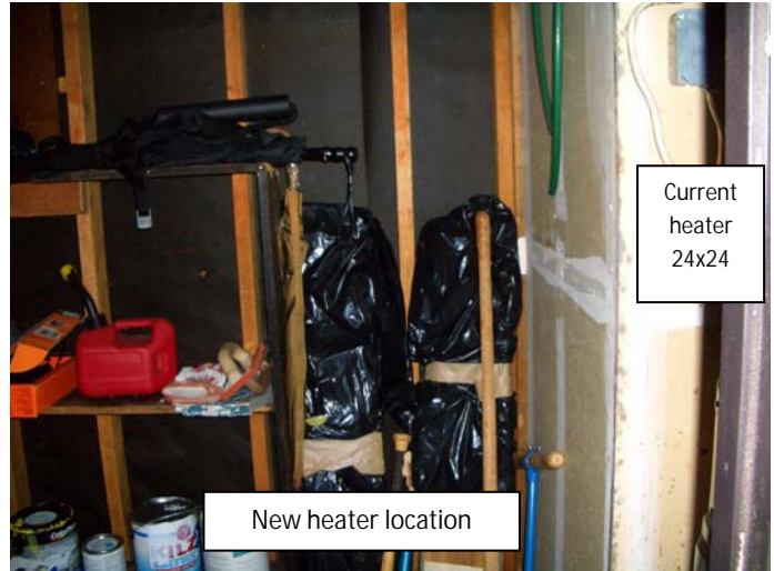
Current heater 24x24